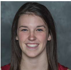
21 • Bridget Carleton 6-1 - Fr. - G Chatham, Ontario, Canada John McGregor Secondary